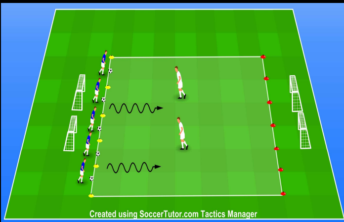
Created using SoccerTutor.com Tactics Manager

This activity is played similar to British Bulldog but with levels.