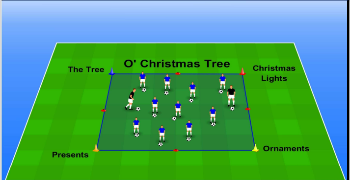
Created using SoccerTutor.com Tactics Manager

Story line - You are setting up the Whoville Christmas Tree but first, you must cut the tree down and then decorate the tree. Then can you put the Presents under the tree.