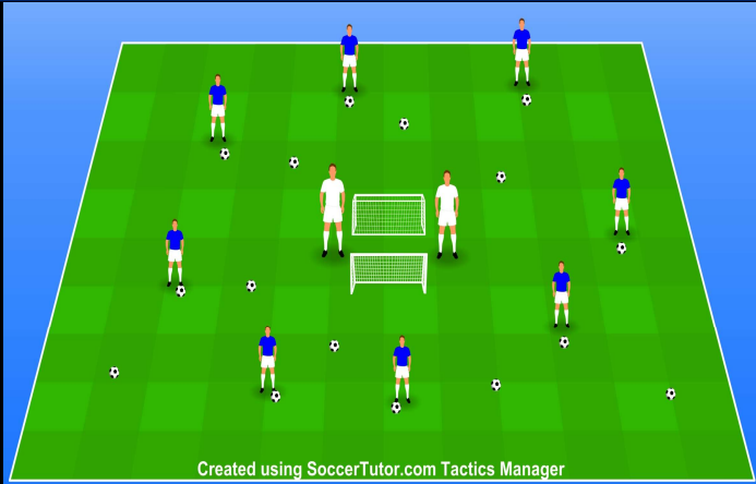
Created using SoccerTutor.com Tactics Manager

Story - All of the players are from Whoville and they are trying to save Christmas by putting all of the Christmas presents back under the tree (the pop up nets). The Coaches will be the Grinches who are trying to ruin Christmas by kicking all of the Christmas presents away from the Christmas Tree.